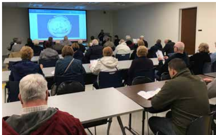
MCHA members and guests watch a presentation at the Museum of the American Revolution in Philadelphia.

Our group thoroughly enjoyed the day, and the visit to the museum not only taught guests about America’s founding but helped everyone gain a deeper understanding of the people, events, and ideals that gave birth to our nation.