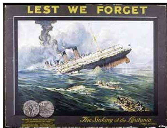
Poster depicts the sinking of the passenger ship Lusitania off the coast of Ireland in 1915, an incident which helped provoke U.S. involvement in World War I.